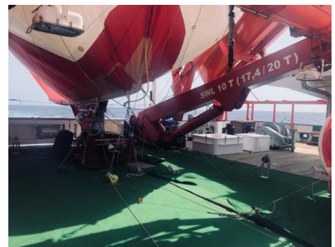
Underside of 250m 3 Desert Star Helikite on ship launch area.