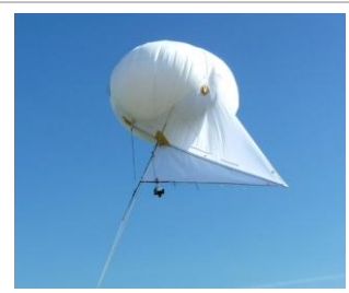
34m3 Helikite steadily lifting E/O + I/R Gyro-Stabilised military surveillance camera.

Information about the 'Border Patrol Helikite' will be available at DSEI on 'Carolina Unmanned Vehicles' stand, number N5-161.