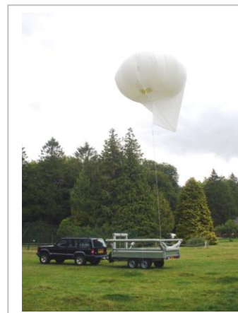
The Rapid-Reaction trailer can inflate, launch and then tow the high altitude Helikite very steadily at speeds up to 30 mph.